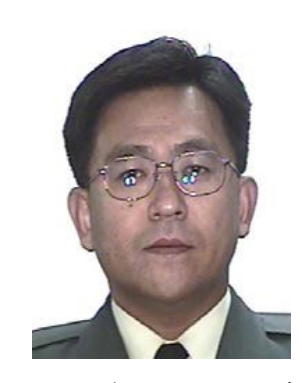
Lieutenant General Toshikazu Yamane Japan ES 2009

Promotion to Deputy Commander, Botswana Defence Force