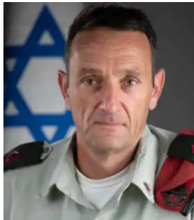
LTG Herzl Halevi Israel