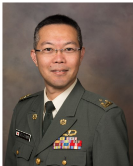
Major General Hajime Kitajima ES 2015

Promotion to Charge of the strategic Kashmir-based 15 Corps