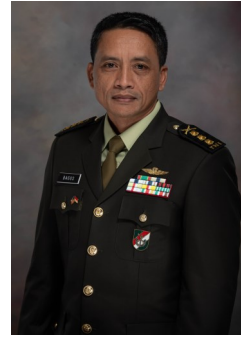
Brigadier General Bagus Tayo NWC 2020

Promotion to one star officer in Indonesian Air Force