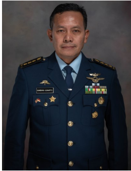
Brigadier General Bambang Gunarto NWC 2020

Promotion to one star officer in Indonesian Air Force